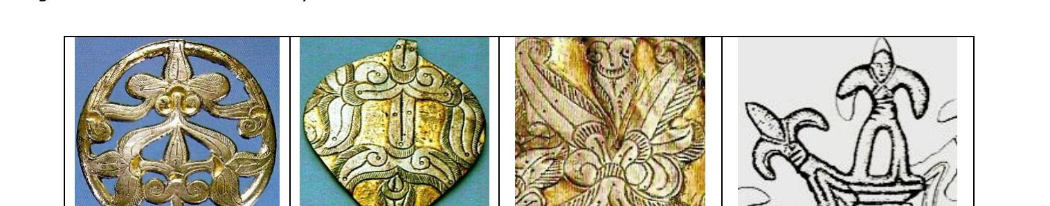
1: A symbolic Mother Goddess, while she gives birth. (Similar designs are defined palmettes, vegetal motifs, trees of life... by the Hungarian "Intelligentsia") 2: The mother Goddess starts being depicted with eyes, nose, mouth, breast, vulva, and the amniotic sac. 3: Gender undefined God: the face is designed as a typical Bronze Age Hungarian mask. 4: Male God with conical hat. (All are Honfoglalás time finds)

After the arrival of the Indo-Europeans, what happened with the ancient culture?